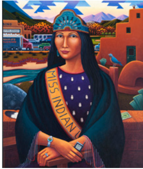
Indian Country: The Art of David Bradley Through January 5, 2020