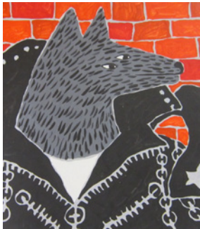
Coyote Leaves the Res: The Art of Harry Fonseca May 19, 2019–January 5, 2020