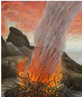
On Fire: Transcendent Landscapes by Michael Scott Through July 28, 2019

FROM TOP: DAVID BRADLEY, POW WOW PRINCESS (DETAIL), 2009, ACRYLIC ON CANVAS, 48 X 36 IN., MUSEUM OF INDIAN ART AND CULTURE; 59073 • HARRY FONSECA, COYOTE IN BLACK LEATHER JACKET (DETAIL), 1979, ACRYLIC ON CANVAS PHOTO PAPER, 12 X 16 IN., © HARRY FONSECA COLLECTION, AUTRY MUSEUM; 2016.10.324 • MICHAEL SCOTT, FIRE AND ICE PACIFIC (DETAIL), 2016–2018, OIL ON CANVAS.