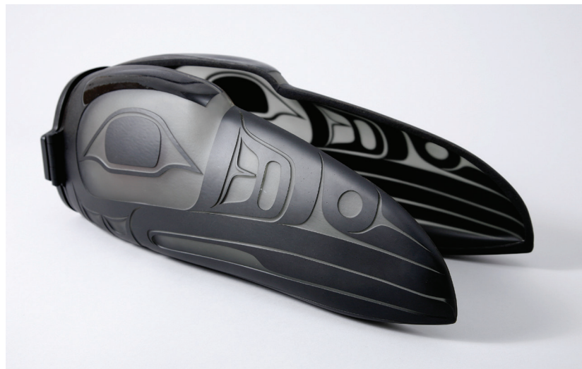
Above and opposite: Preston Singletary, Raven Transformation Mask, 2010

We invite you to join us in helping develop this model twenty-first-century museum.