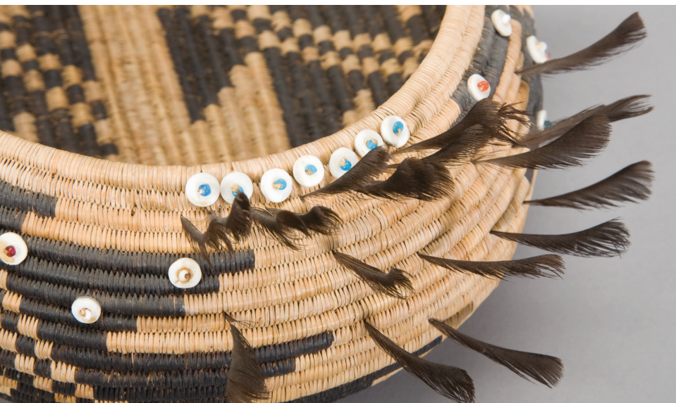
Pomo feathered boat basket, circa 1900

West and the multiple cultures, perspectives, traditions, and experiences—real and imagined—that make the West a significant and unique part of the world.