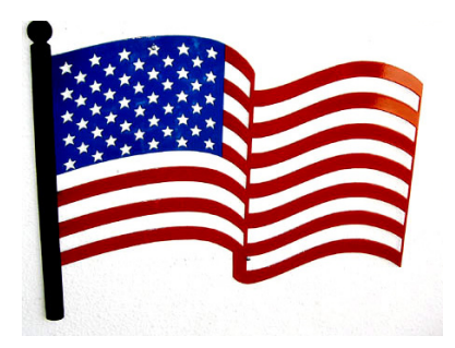
A politician is someone who is elected to work in government .