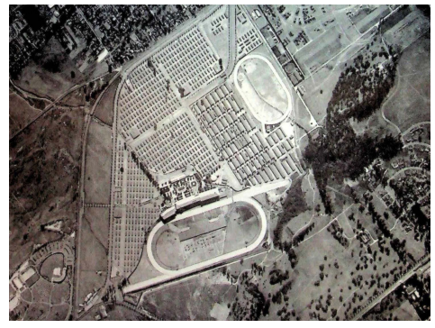
Santa Anita Assembly Center (Photograph and caption from page 177 of the Japanese Evacuation from the West Coast, 1942: Final Report )

Most of the "assembly centers" that Japanese Americans were incarcerated in were located at fairgrounds, former camps, or racetracks. The photographs below include two different "assembly centers" located at racetracks. A photograph is another example of a source that you can analyze to learn more about the forced removal and incarceration of the Japanese American community during World War II. These photographs are primary sources because they were made during the time period being analyzed. These photographs are of the Santa Anita Assembly Center in Southern California and the Tanforan Assembly Center in Northern California. Look closely at the photographs and read the captions underneath the photographs. Then answer the questions below the photographs and their captions.