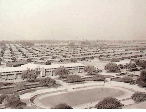
A portion of the complete Santa Anita (California) Assembly Center, situated within the world famous racetrack at Arcadia, California. This was the largest of all Assembly Centers. Nearly 19,000 persons were lodged here.