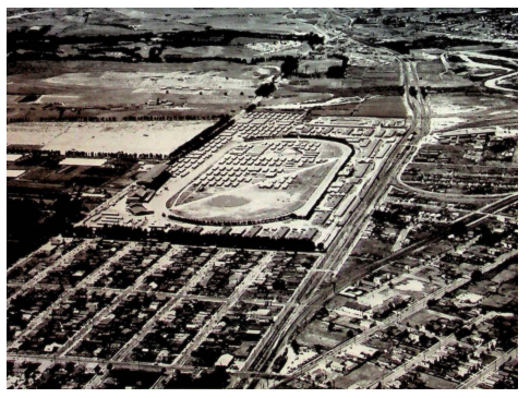
Tanforan Assembly Center (Photograph and caption from page 179 of the Japanese Evacuation from the West Coast, 1942: Final Report )