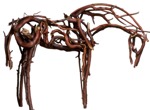
Sculpture: A three-dimensional (you can see all of the sides as you walk around it) work of art such as a statue made by an artist out of materials that are used in an interesting way