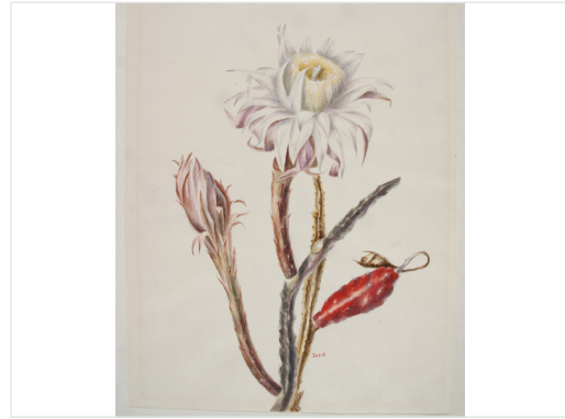
Painting: A two-dimensional (flat) picture of something made by an artist using paint