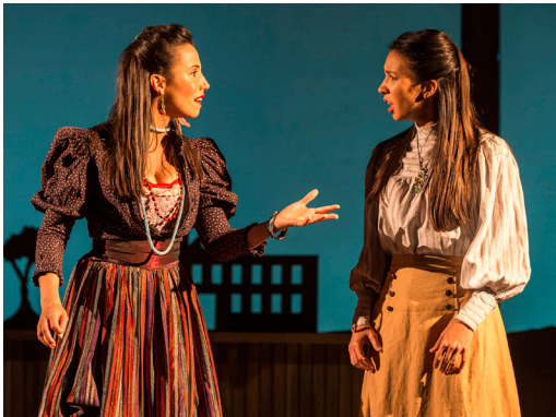
Performance: Creative activities such as dance, music, or a play that are performed by artists in front of an audience