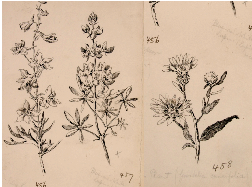
Drawing: A two-dimensional (flat) picture of something made by an artist using crayons, markers, pencils, or pens instead of paint

PART 3 – Similar to nature, art comes in many different forms. Art can be a drawing, painting, performance, photograph, sculpture, and so much more. Learn more about some of the different types of art by reading the art descriptions below.