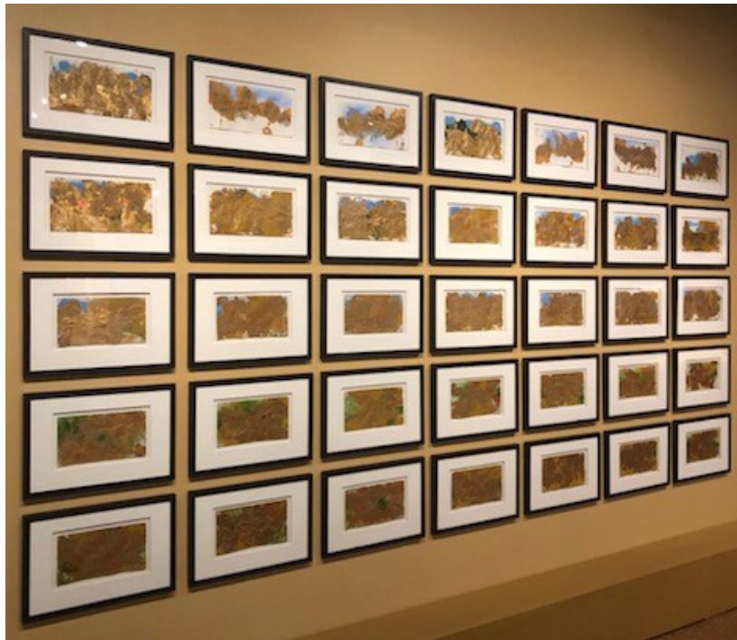
A Series of Paintings from the Autry Museum of the American West

PART 1 – Creating art is a form of activism. Artists have been creating art as a form of activism throughout history. Artists can educate others about the different social issues affecting communities through their art. Let’s analyze (study) art that incorporates activism by noticing the communities and social issues represented in the art. Take a moment to look closely at this series (a number of things of a similar kind coming one after another) of paintings from the Autry Museum of the American West. Then look at the three individual paintings from the series of paintings.