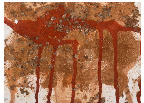
Three Individual Paintings from the Series of Paintings