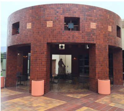
Autry Plaza Rotunda

California Yarnscape will have seven sections of four large rectangles. The Rotunda has eight sections. One of the sections is obscured by the adjacent cafe building. Up to 28 large rectangles and 21 small squares will be selected for the exhibition. The view obscured section will be created as an open participation, YBLA project.