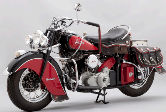
Indian Chief Roadmaster motorcycle, Indian Motorcycle Manufacturing Company, 1948. Leather, metal. Museum purchase, Autry Museum; 97.70.1