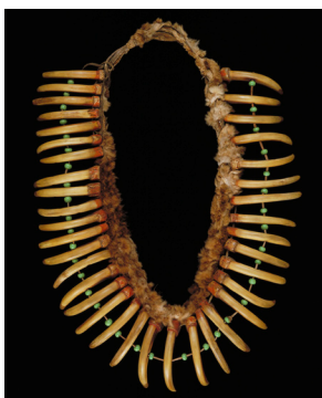
Bear claw necklace, Yankton Dakota (Sioux), mid-19th century. Grizzly bear claws, leather, ochre, beaver fur, glass beads. Museum purchase, Autry Museum; 89.54.1

Sioux men had to earn the right to wear a necklace like this, usually through acts of bravery. Made from the claws of the now extinct Plains grizzly bear, this necklace represented the owner's power as a hunter, warrior, and leader.