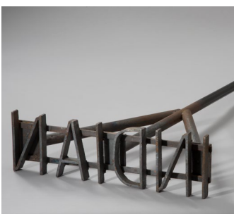
Sculpture: a 3D artwork made out of materials that are used in an interesting way