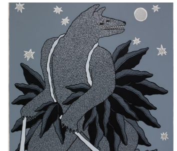
Print: a 2D work of art created by copying a picture from a surface with ink to another material