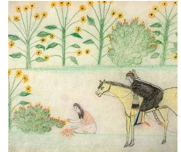
Drawing: a 2D picture of something using chalk, crayons, markers, pencils, or pens