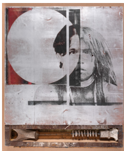
Mixed media: an artwork that incorporates more than one type of medium