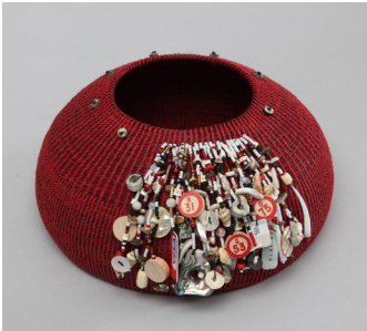
Basket: a 3D artwork created by weaving plants and sometimes other materials together

PART 4 - Before you tell a story about what the word “future” means to you through a two-dimensional artwork, you will explore different types of artwork. Artwork can be collages, drawings, graphic prints, mixed media, paintings, photographs, and so much more. Learn more about some of the various types of artwork by looking at images from the Autry Museum’s collection and reading their descriptions.