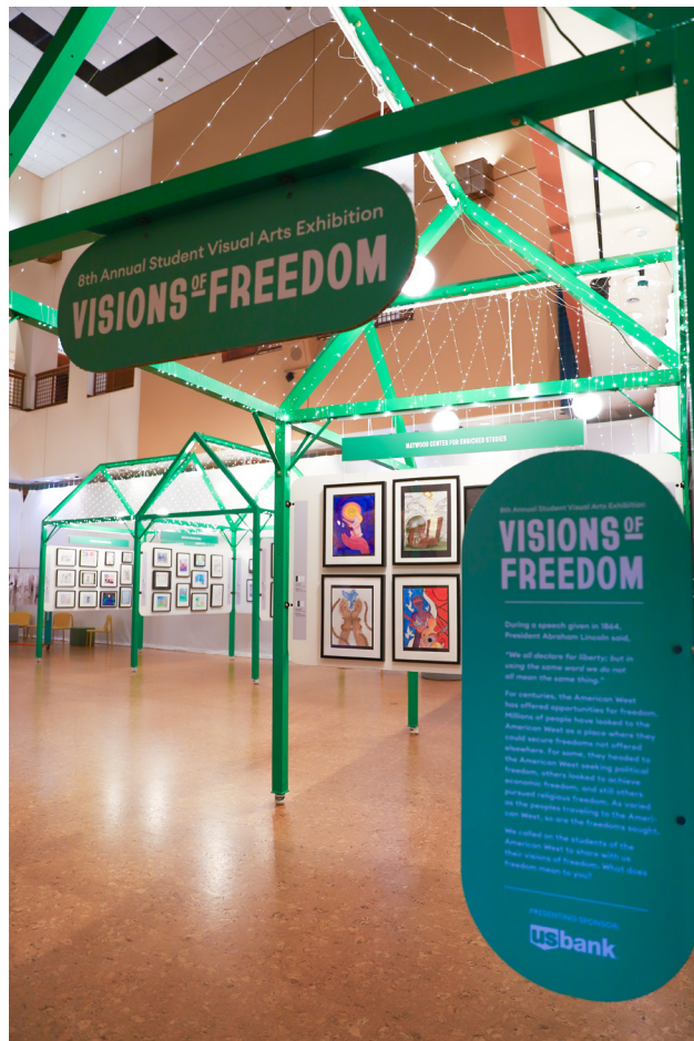
This image was taken at the 8th Annual Student Visual Arts Exhibition titled Visions of Freedom on April 20, 2024.

INTRODUCTION – The Autry Museum of the American West is a museum located in Griffith Park in Los Angeles, California. The Autry Museum’s mission is to bring together the stories of all peoples of the American West, connecting the past with the present to inspire our shared future. One of the ways that the Autry Museum tells stories about the diverse peoples of the American West is through objects. Objects can be artifacts or artwork. Since 2016, the Autry Museum has invited students in grades 6 through 12 to tell their own stories through artwork by submitting their own two-dimensional (2D) artwork to the Student Visual Arts Exhibition . The Autry Museum displays selected student artwork in the museum during its Student Visual Arts Exhibition each year as shown in the image below. If you are interested in submitting your artwork for this year’s Student Visual Arts Exhibition, the activities in this lesson will help guide you through the artwork part of the submissions process.