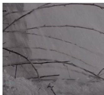
Video: a recording of visual images that may include audio