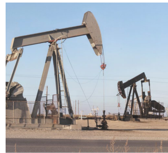
Photograph: a 2D picture of something taken with a camera