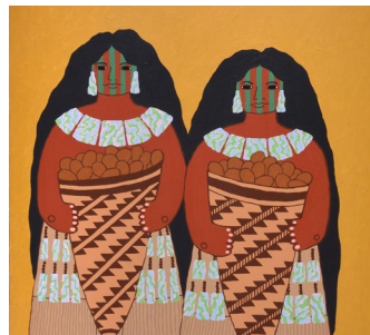
Painting: a 2D picture of something using paint