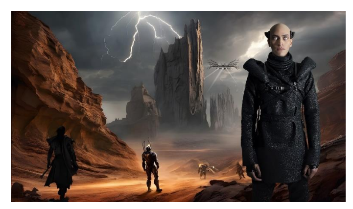
Survivalship Arrival, 2022. Courtesy of Virgil Ortiz (Cochiti Pueblo).