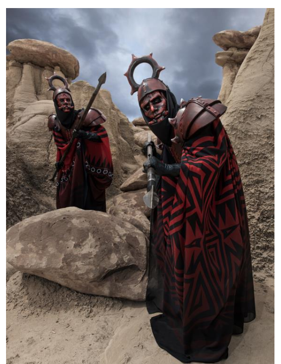
Jai Nopek, Recon Watchman, 2022. Courtesy of Virgil Ortiz (Cochiti Pueblo).