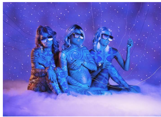
Three Sisters, 2022. Courtesy of Cara Romero (Chemehuevi).

(June 24, 2024 - Los Angeles, CA)—Future Imaginaries: Indigenous Art, Fashion, Technology explores the rise of Futurism within contemporary Indigenous art as a means of enduring colonial trauma, creating alternative futures and advocating for Indigenous knowledge systems as vital to achieving social justice in the present and sustainable communities going forward.