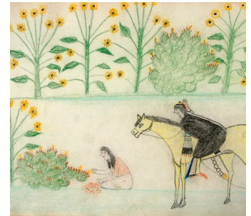
Drawing: a 2D picture of something using chalk, crayons, markers, pencils, or pens