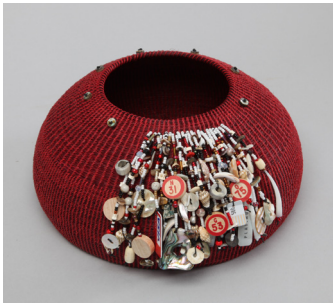
Basket: a 3D artwork created by weaving plants and sometimes other materials together

INTRODUCTION – The Autry Museum of the American West is a museum located in Griffith Park in Los Angeles, California. The Autry Museum offers many different types of exhibitions such as the Masters of the American West Art Exhibition and Sale . This annual exhibition displays artwork made by contemporary artists that tell stories about the diverse peoples, animals, plants, and landscapes in the American West. This exhibition's artwork can be viewed and purchased. Artwork comes in many forms. Learn more about some of the various types of artwork by looking at images from the Autry Museum and reading their descriptions.