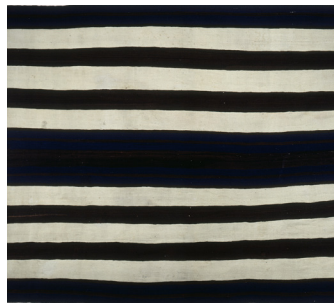
Textile: A woven work of art such as cloth