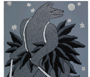
Print: a 2D work of art created by copying a picture from a surface with ink to another material