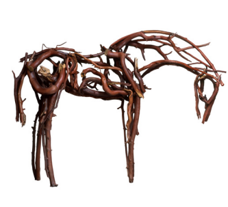
Sculpture: a 3D artwork made out of materials that are used in an interesting way