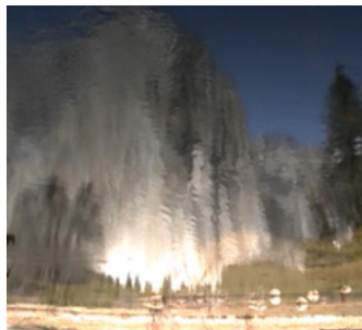
Video: a recording of visual images that may include audio