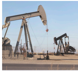
Photograph: a 2D picture of something taken with a camera