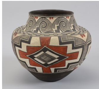
Ceramic: a 3D artwork made of material like clay that is hard from heat