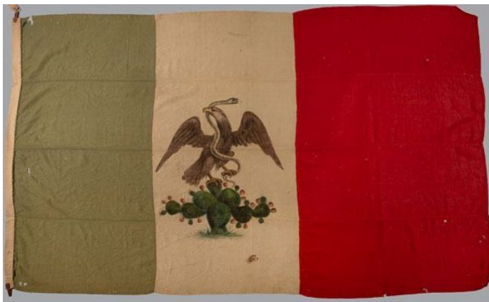
Mexican flag flown in Los Angeles as part of independence celebrations, 1823-1864; 1895.G.11

The exhibition is more than a history of Los Angeles—it is a reflection of how the freedom struggles of LA and its diverse people have shaped our individual lives, the places we live, and the nation as a whole. Life, Liberty, and Los Angeles will run May 30, 2026 through January 31, 2027, in the Marilyn Calvin and Gross Gallery.