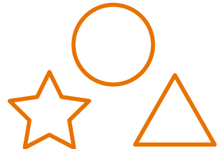
Shapes circles, triangle and stars