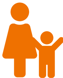
Stories woman and her son walking