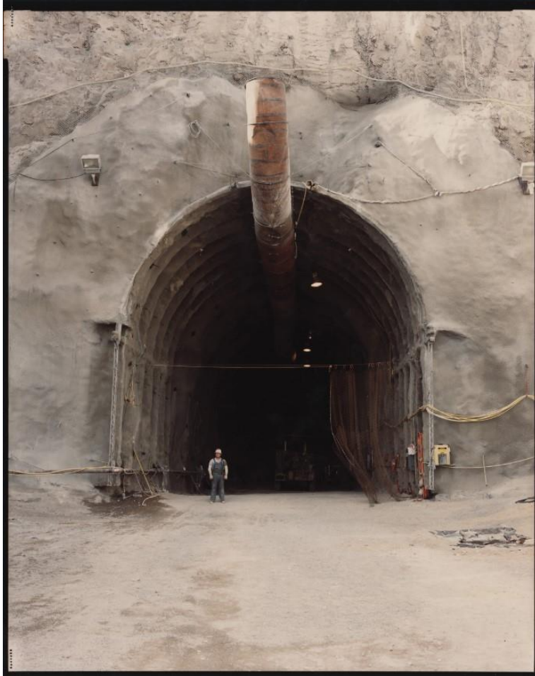
Richard Misrach, Entrance, "Yucca Mountain Nuclear Waste Repository (under construction), Nevada," 1994, Pigment print, Courtesy of the artist and Fraenkel Gallery, San Francisco

The exhibition is broken up into three sections "Site Unseen," "Survey to Surveillance" and "Remote Control" which seek to revisit and revise our understanding of visual technologies as applied to remote Western lands and places that are within and without modern society.