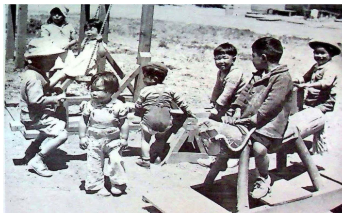
A play scene at Tanforan (California) Assembly Center, with home-made rocking horses, teeter-totters, and swings. Playfields with rustic equipment made of scrap material and other installations stimulated recreational and outdoor play activities which many young evacuees had never before enjoyed. (Photograph and caption from page 469 of the Japanese Evacuation from the West Coast, 1942: Final Report )