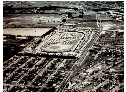
Tanforan Assembly Center (Photograph and caption from page 179 of the Japanese Evacuation from the West Coast, 1942: Final Report )

What do you see in the photographs? _____