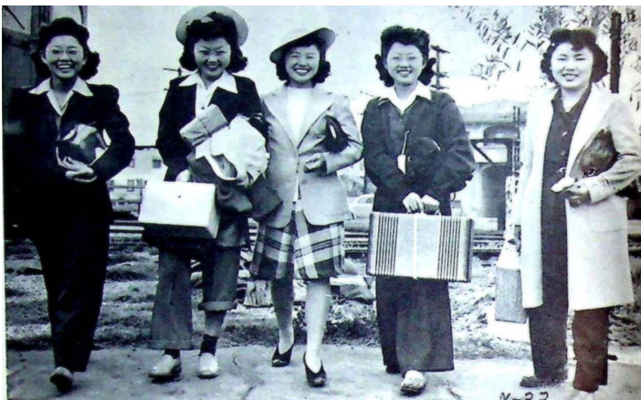
Group of young Japanese girls arriving at a Long Beach, California railroad station to board a special electric train for the Santa Anita Assembly Center, April 4, 1942.