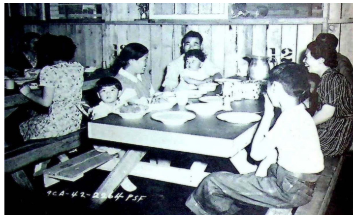
A family group at mess at Tanforan (California) Assembly Center. Every effort was made to provide mess facilities for family groups. (Photograph and caption from page 456 of the Japanese Evacuation from the West Coast, 1942: Final Report )