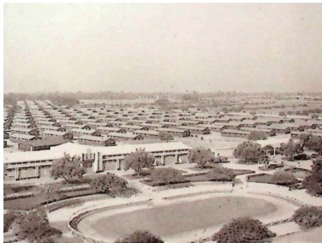
A portion of the complete Santa Anita (California) Assembly Center, situated within the world famous racetrack at Arcadia, California. This was the largest of all Assembly Centers. Nearly 19,000 persons were lodged here. (Photograph and caption from page 433 of the Japanese Evacuation from the West Coast, 1942: Final Report )