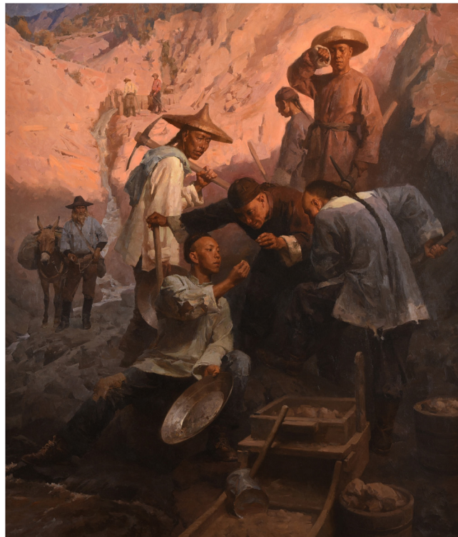
The Gold Nugget, Chinese Camp 1850 by Mian Situ

Look closely at the artwork below. It shows Chinese gold miners looking at a gold nugget as other men watch in the distance. Find some clues (e.g. tools) that show these men are gold miners. Then circle these clues on the artwork.